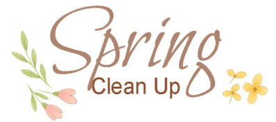
Spring Clean Up Page 11