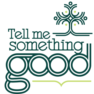
Lent 2026 Page 6