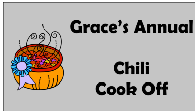
Chili Cook Off Page 7