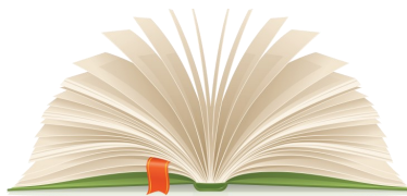
Wisdom Seekers Page 8